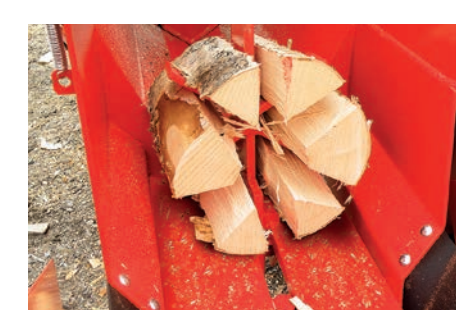
6-way splitting blade available as an accessory.