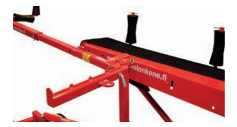
The support is integrated inside the arm.