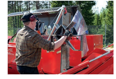
Replacing the splitting blade is fast and safe thanks to the detachable winch.