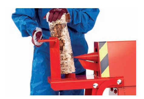
Safe splitting with a steel cone.