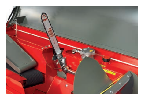
Effective hydraulic saw.