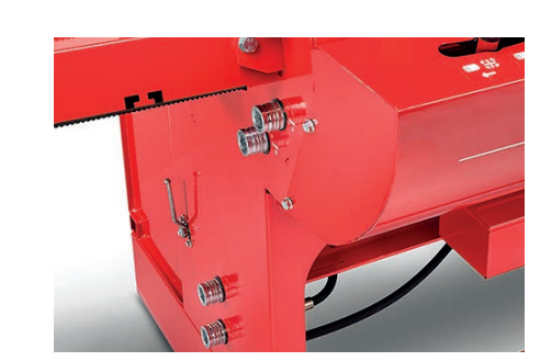
Hydraulic hoses can be connected to the machine easily with quick couplers available as an accessory.