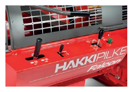
The ergonomic and easy-to-use control panel makes the machine easy to operate.