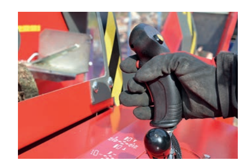
Electrical control of sawing and splitting with just two buttons.