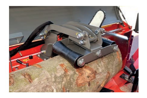
The hydraulic log clamp enables logs of all sizes to be sawed effortlessly.