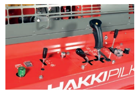
The machine's functions can be easily controlled with the ergonomic and easy-to-use control panel.