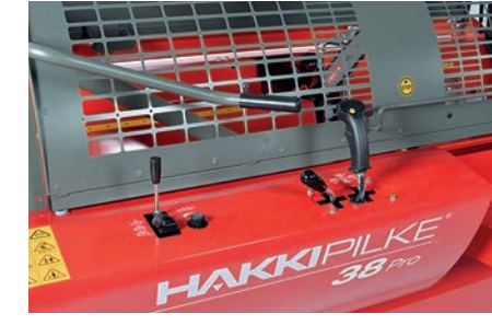
The ergonomic and easy-to-use control panel includes all the controls needed to operate the machine.