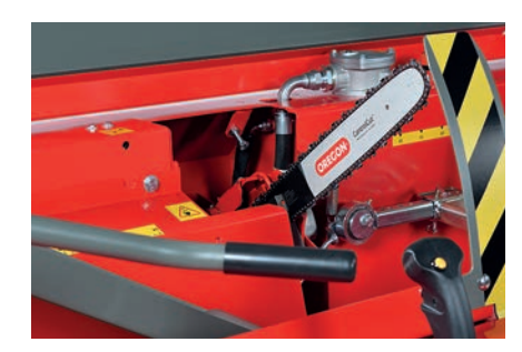
Together, the AC10 and electrical saw control ensure fast and uninterrupted operation.