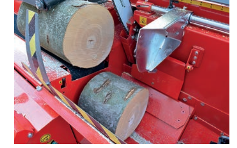
The log landing plates ensure that even the shortest cut logs land neatly into the splitting groove.