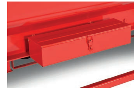
Convenient tool box as standard.