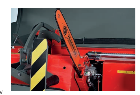
50 Pro is equipped with patented AC 10 automatic chain tensioner. Always correct chain tension makes cutting efficient and extends the chain and bar life remarkably.