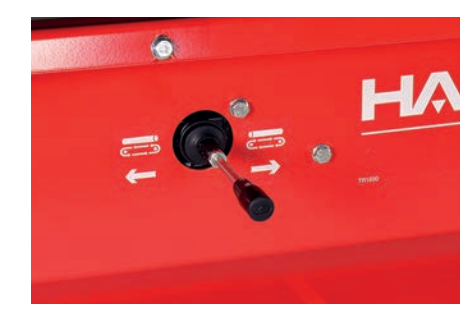
Infeed conveyor reverse valve available as standard.