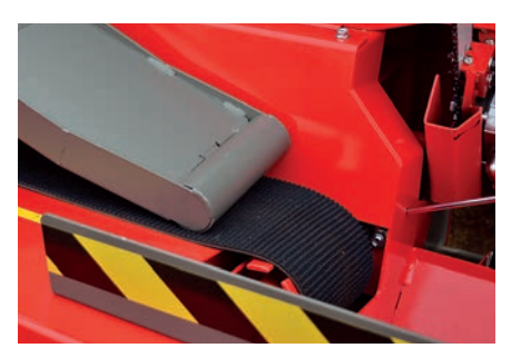
Log feed using a heavy duty belt with a rough surface.