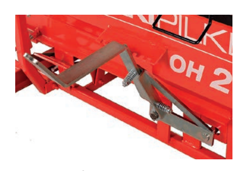
The height of the splitting blade can be adjusted quickly and easily with a manual lever.