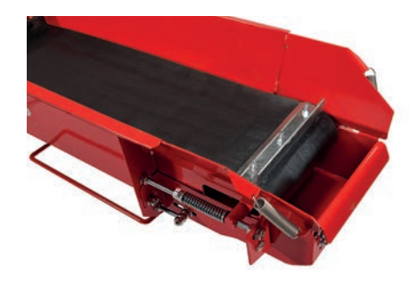
Patented cleaning outfeed conveyor as standard. The groove at the end of the outfeed conveyor separates debris from the firewood.