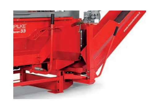
Comes with a hydraulically pivoting outfeed conveyor as standard.