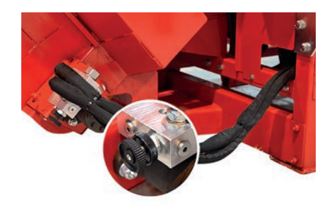
Outfeed conveyor speed control valve as easy-to-install accessory.