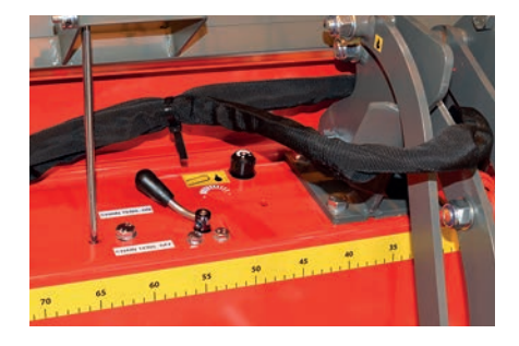
The AC 10 automatic chain tensioner maintains optimal saw chain tension at all times. The chain can be conveniently replaced after releasing chain tension with the lever pictured – no tools required!